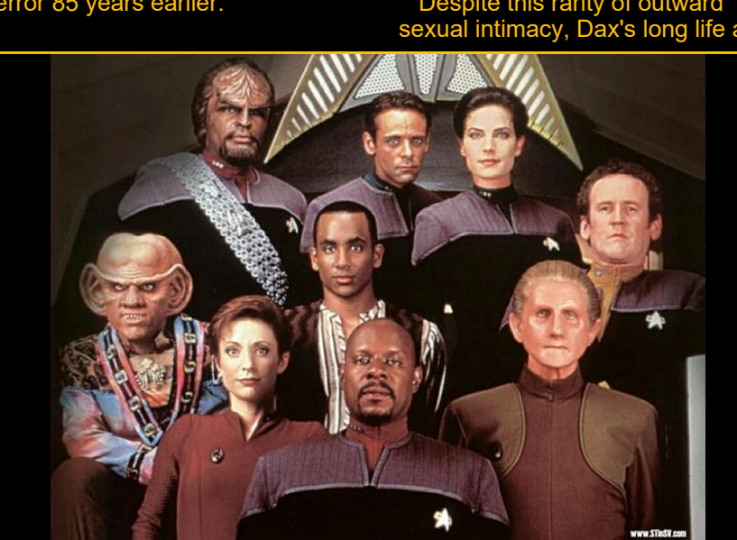
Crew of Deep Space 9

Despite this rarity of outward sexual intimacy, Dax's long life as