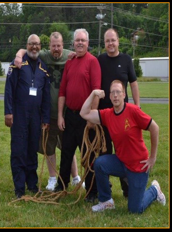
Continued on page 18