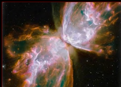
One of the many incredible deep-space images taken by HST. (Experiencing Hubble: Understanding the Greatest Images of the Universe, The Great Courses)

This course is great viewing for the whole family, and for all ages. It's a favorite that's often re-watched by the youngest members of my household, who are ages 9 and 4. It offers amazing views of the universe, accompanied by easy-to-understand explanations of some of the interesting science behind the images.