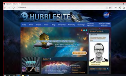
The HUBBLESITE home page. ( http://hubblesite.org/ )

great tool to use for more in-depth learning after watching Experiencing Hubble , as it can lead to answers to many of the questions that may come up while you and your family watch that course.